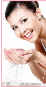
Just wash your face twice a week with Acne Scrub

Treatment consists of washing the face twice a week, morning and night, with Acne Scrub and water. Redness should start to disappear in 24 hours. Improvement should begin almost at once.