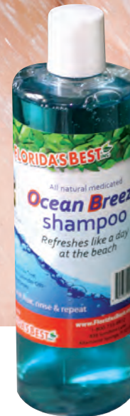
16 oz. bottle

All-natural PH balanced Tea Tree, Peppermint and Lavender oils combine to create the most refreshing shampoo you will ever experience.