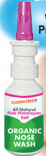
Pocket Size, Take Anywhere

Breath Easier & Faster Without A Prescription!